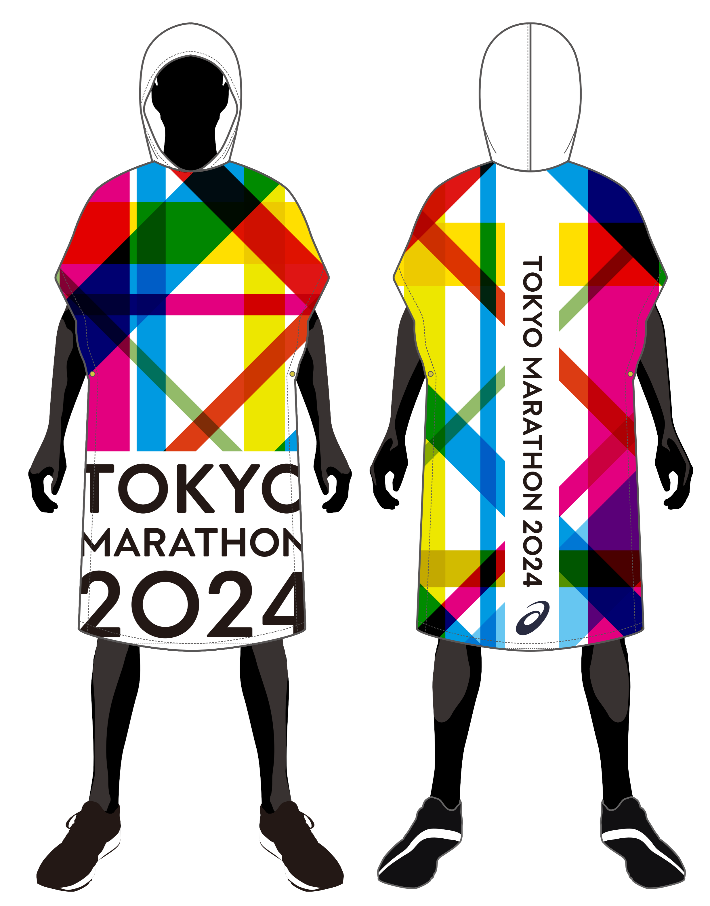
*The design is from the previous event.